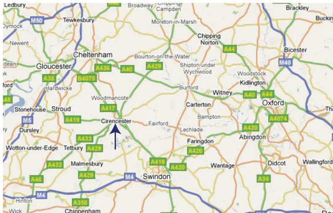
© 2010 Google map data © 2010 Tele Atlas